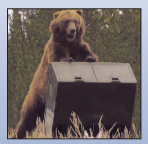
Industry standard for bear resistant containment.