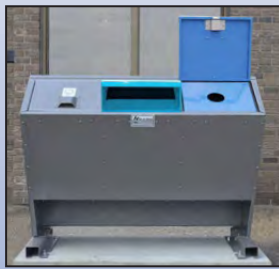
Combination collection for waste and/or recyclables.

Side-hinge unloading door for ease of servicing.