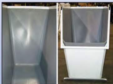
Interior poly liner retains material, moisture, and prevents corrosion.