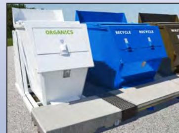
Designed to work with existing container footprint.

Galvanneal steel panels and an Axalta powder paint finish ensures a long life, for lower lifecycle costs & total cost of ownership.