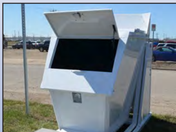
Loading door prop for easier material loading.