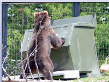
Hyd-A-Way is our original BearTight container, bear tested and certified!