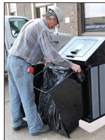
Front loading and unloading doors allows for placement against buildings.

Optional concrete pad with proven anchoring system.