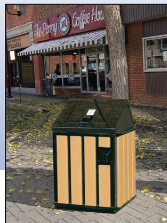
Aesthetically pleasing for feature developments.